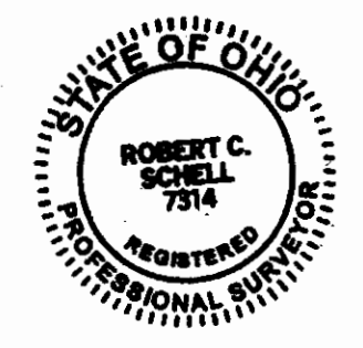
Resistened Surveyor No. 7314 Date: August 16, 2003

Deed Ref.: Vol. 1109-Page 297 Parcel No. ר-ר-ר) (PT.)