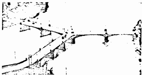
THE FAMOUS Y BRIDGE