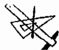
EXHIBIT "A" II